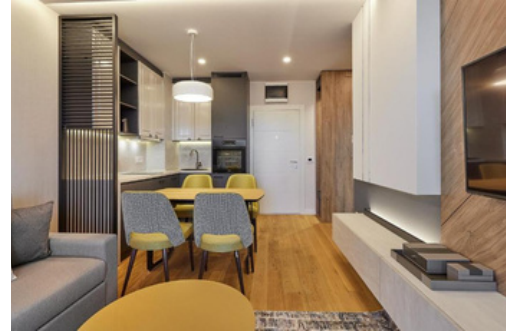
Apartments by Bor